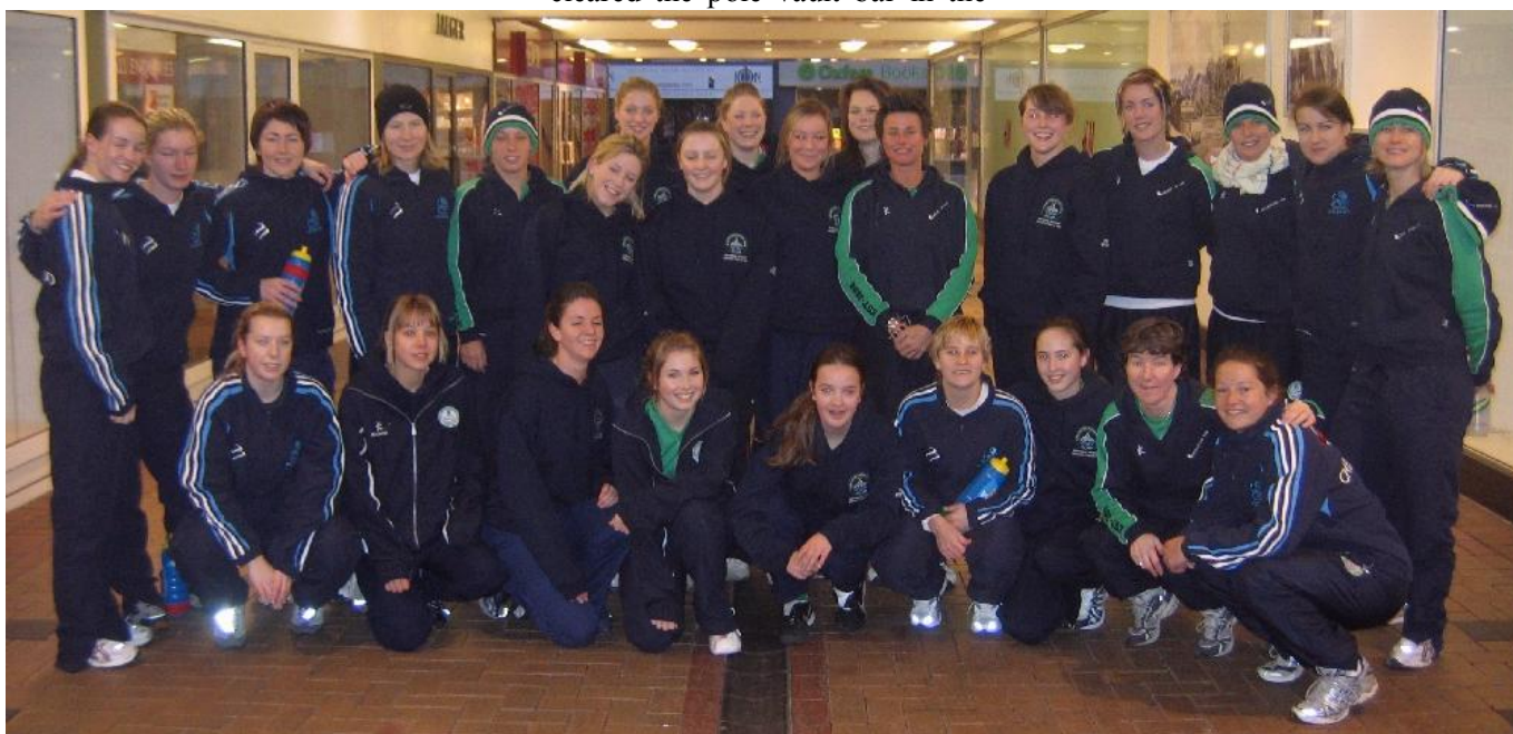
The Girls U18's National Indoor Squad and the members of the Ladies' 1 st XI Cup Winning National Indoor Squad - NIA 2006